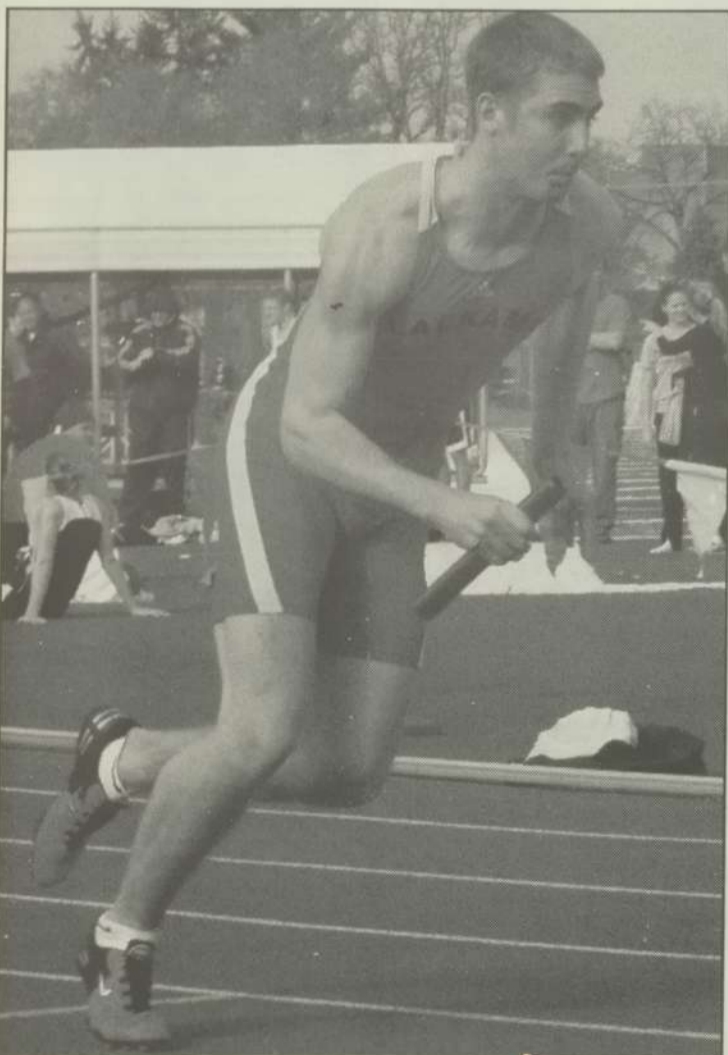
KEONI MCHONE CONTRIBUTED