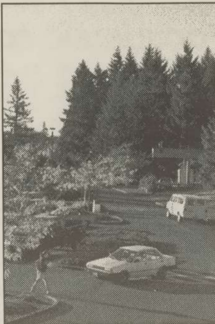
CORY PRICE CLACKAMAS PRINT

At 9 a.m., just before many morning classes begin, students circle Barlow parking lot, which has been expanded by the newly installed gravel lot.