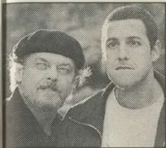
JACK NICHOLSON and ADAM SANDLER