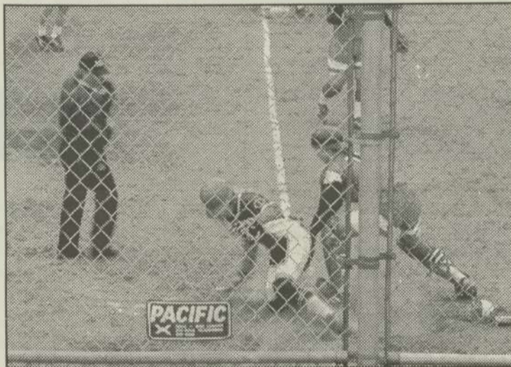
NIC DELZELL Clackamas Print

The second game of the Mt. Hood doubleheader was rained out. The game was made up on April 14. Results will be reported in the next edition of The Print. Today, Clackamas will play Lower Columbia in a makeup game from last Saturday. Game time is 4 p.m. on the Cougar diamond.