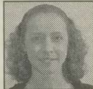
Bekah Finch Staff Writer

So resurrect those flags and flyers and let's show support in a united stance for the spirit of America.