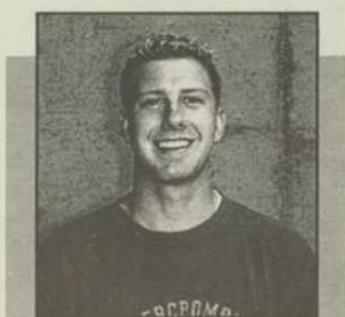
From the Bleachers