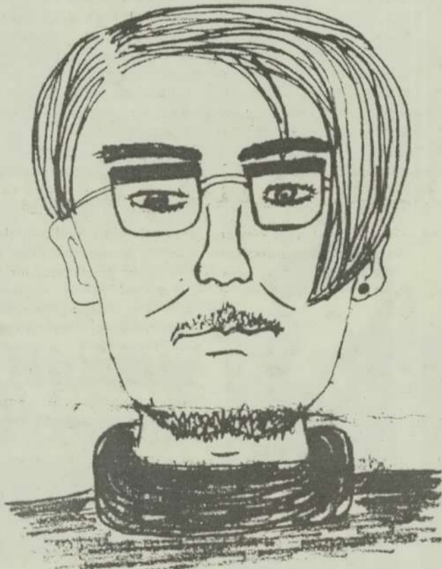
This is a tip from the online forum.