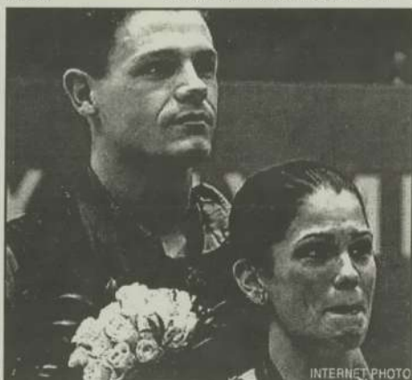
The Canadians pleased the crowd but not the judges with their silver medal winning pairs figure skating performance.

The Olympic action will continue for the next couple of weeks, concluding on Sun., Feb. 24. Many events will be televised on either NBC, MSNBC or CNBC, so for more details, check the out www.saltlake2002.com .