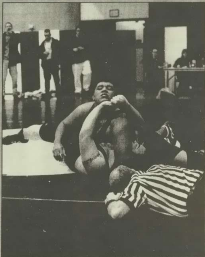
MIKE POLLOCK / Clackamas Print