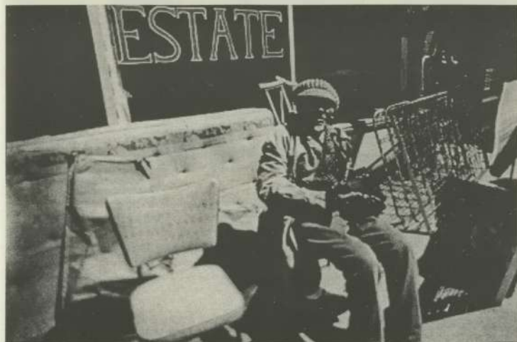
● Cathy Cheney "Untitled (Estate)" (1985) -gelatin silver print-