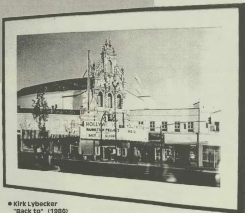
● Kirk Lybecker "Back to" (1986) -watercolor-