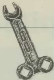
Take a look at our Tool special on Page 5.