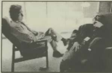
A man from space visits our planet. Check out our movie review on Page 9.