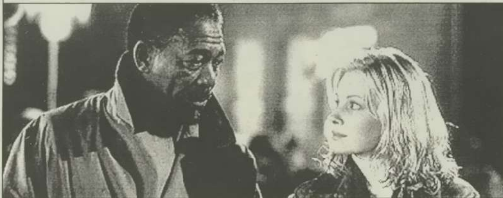
Dr. Alex Cross (Morgan Freeman) and partner (Monica Potter) search for a teacher turned kidnapper.

ond, because of my nervous mindset and therefore sweaty hand, my date obviously does not enjoy the handholding. Finally, the movie isn't as scary as I thought it would be, and that's all right with me, considering I have the courage of a newborn kitten. But I digress. As Alex Cross continues digging through the ever-mounting evidence, he discovers a plot nothing short of plain evil. "So what's her deal anyway? I mean, she asked me out. Wait, who cares, Monica Potter is way hot." The movie ends and mercifully, so does the awkward handholding. "Along Came a Spider" is a movie full of surprises. Although I would not say it's even near one of my favorites, it is definitely an entertaining thriller full of twists and turns as well as a surprise ending. I'd give it a "go ahead and rent it as long as you aren't trying to make a move," because, as I discovered the hard way, "Along Came a Spider" is no turn on.