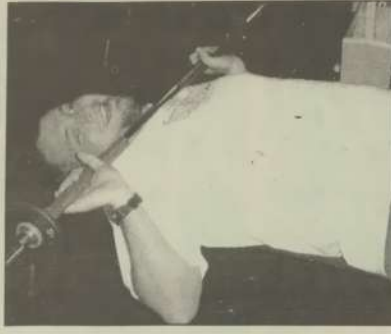
9: Forget a spotter at the gym.