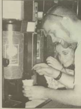
3: Drink too much coffee and go crazy.