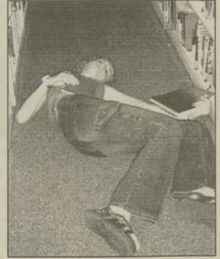
1: Pass out while studying in the library.