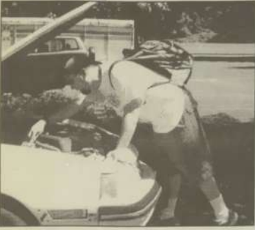
10: Buy a car that doesn't run.