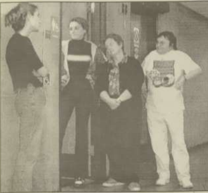
4: Get stuck in line at the bathroom.