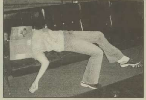
8: Study all night and sleep through finals.