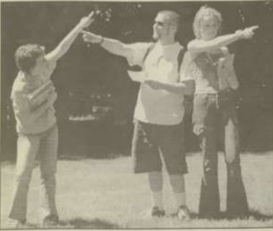
7: Get lost.