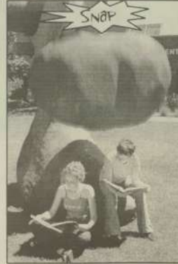
2: Get crushed by rock sculpture.