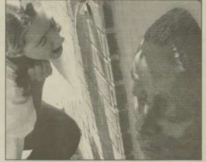
5: Mistake fountain water for drinking water and get sick.