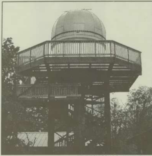
Haggart Observatory is now open.