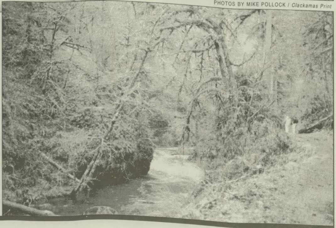
Top right: Lower South Falls is only a short hike from the lodge. Above: Lower North Falls is the lowest falls on the North Fork of Silver Creek. Middle right: A fallen tree creates an obstacle across the path. Right: Canyon Trail winds beside Silver Creek.