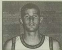
Lawson Struve Wing