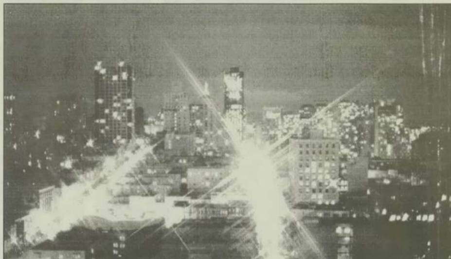
Above: Night view in downtown San Francisco from the Golden Gate Holiday Inn. Below: View from Alcatraz of the Bay Bridge and downtown San Francisco.