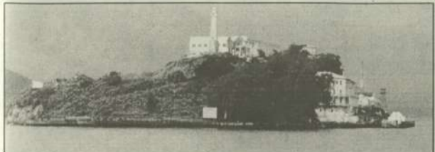
View of Alcatraz where famous criminals used to be imprisoned.

Our four days in San Francisco came to an end as we flew over the city at night, seeing the Bay Bridge, Alcatraz and the Golden Gate Bridge.