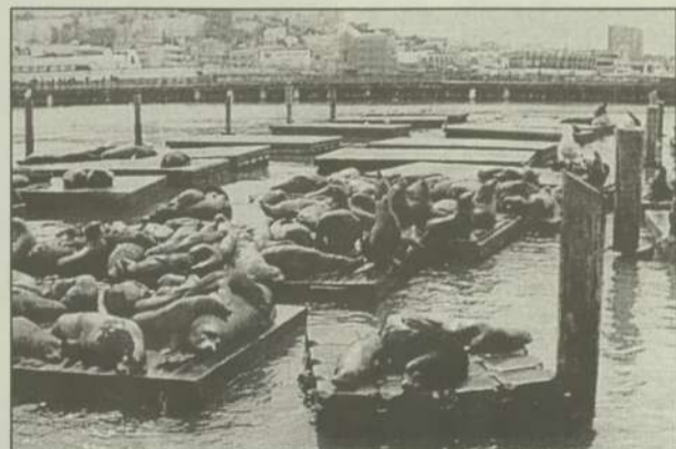
Sea lions are enjoying the sun at Fisherman's Wharf.

and loved being the tourist instead of a rushing commuter, riding the cable cars as a treat and enjoying the excitement in the faces of the others as they experienced it for the first time.