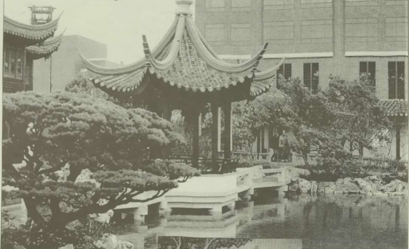
Above: A pine that took fifty years to prune extends out in front of the Moon-Locking Pavilion.

As you run your hand along the smooth wooden railing, the fresh fragrance in the air pleases your nose. If you get too cold outside, you can step into the Tower of Cosmic Reflections for