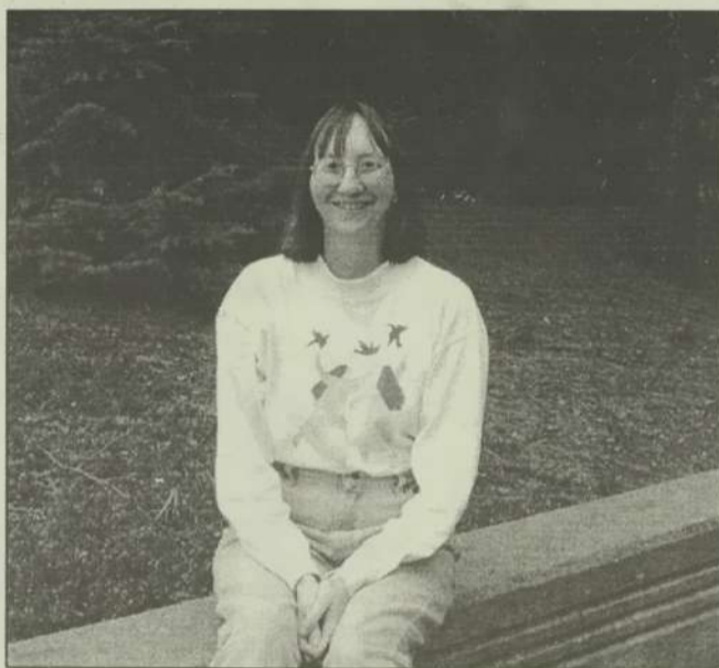
JENNY CHAVEZ / Clackamas Print