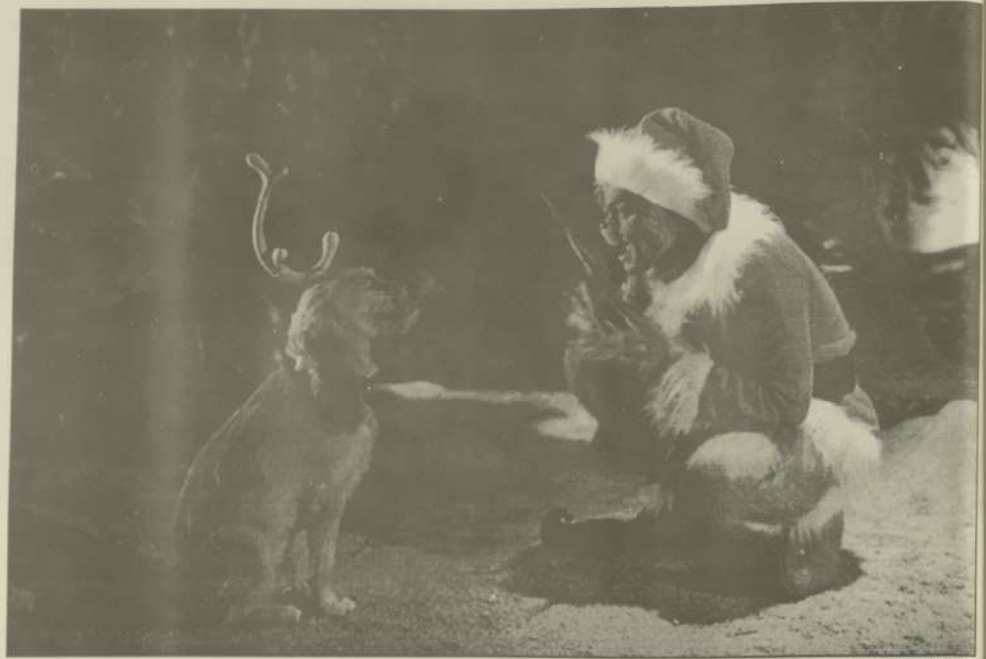
Grossing $73.5 million, " Dr. Seuss' How the Grinch Stole Christmas " stole the Thanksgiving holiday weekend audiences from other movies.

The movie is a social satire playing on stereotypical gender roles. Comedically Carrey is right on here as he manages to poke fun at everyone,