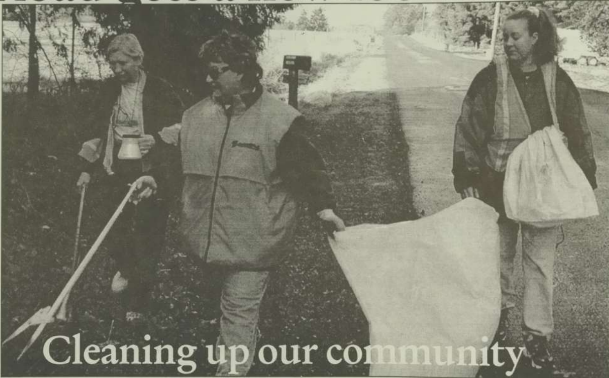
Cleaning up our community