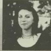
Corinne Rupp Staff Writer

The room was full of people hoping to hear some of the history of this ongoing battle between the Israelis and Palestinians. What we actually saw was an hour of blame and name calling by two people who should know better.