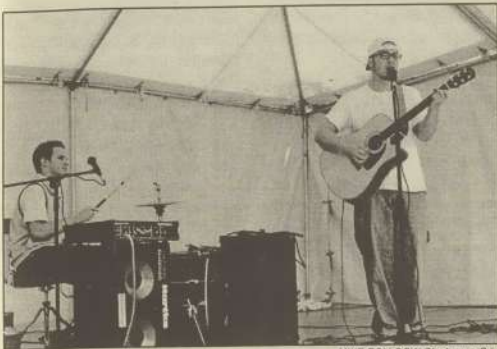
MIKE POLLOCK / Clackamas Print