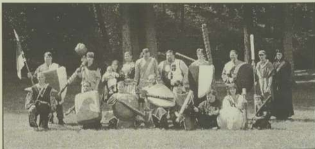
[left] The costume is a large part of assuming the Amtgard persona. Awards are given for outstanding self-tailored costumes.

ATTENTION: FULL-TIME STUDENTS AND STAFF!