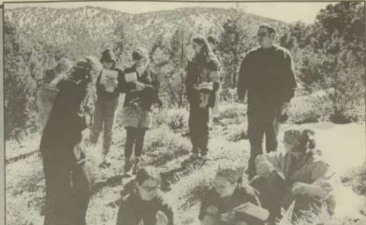
Listening to a presentation at the charcoal kilns. Yes, that is snow on the ground.