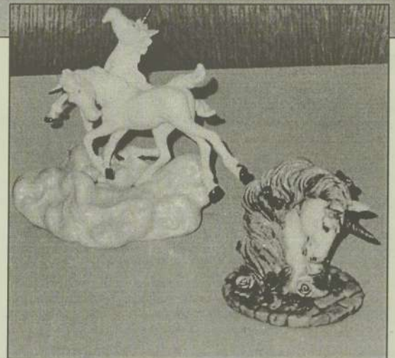
Not all of the unicorn art is serious; a number of the pieces are quite comical.