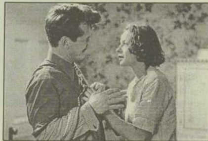
Sean Penn and Samantha Morton share an intimate moment in Sweet and Lowdown .

songs. Penn is almost unrecognizable as Ray and he does a wonderful job of combining a melodramatic guitar player, a womanizer, a kleptomaniac, and a drunk all into one character. Despite Ray's despicable antics, you sympathize with him, which means