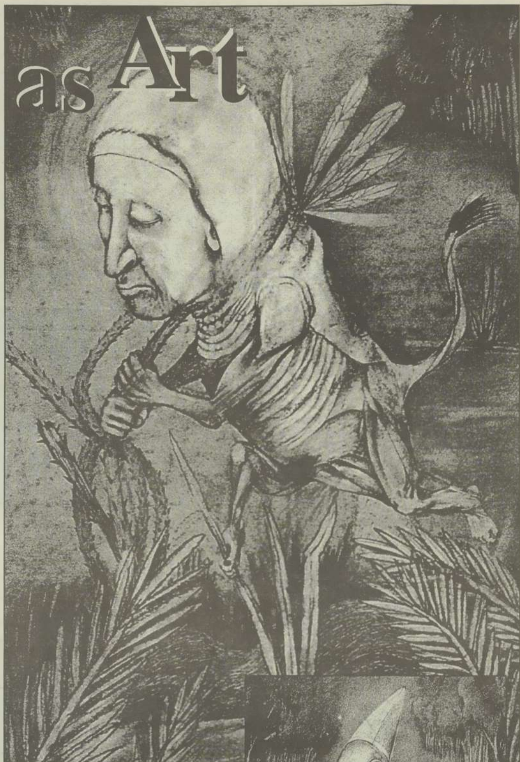
TIMOTHY A BELL / Clackamas Print