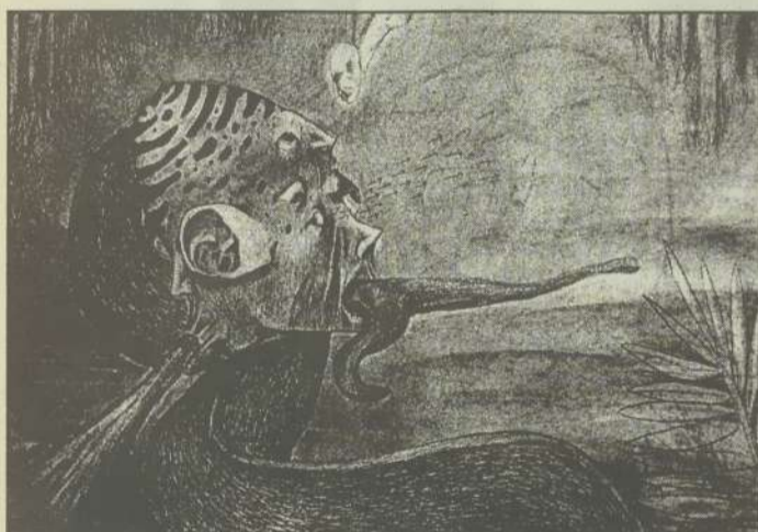
TIMOTHY A BELL / Clackamas Print