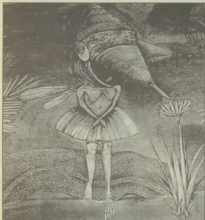
[Above] "Bee Queen"