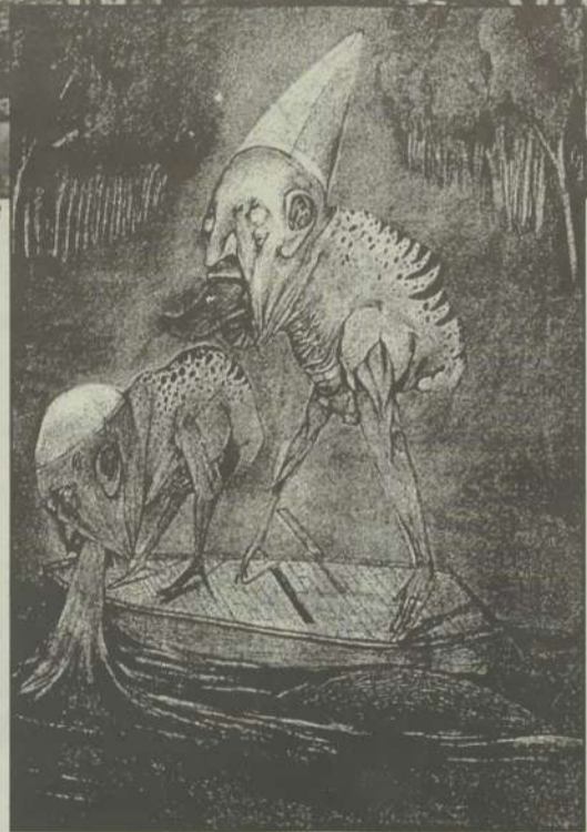
TIMOTHY A BELL / Clackamas Print