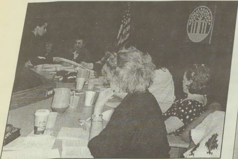
The six member Appeals Review Committee was comprised of two students and four college staff members.