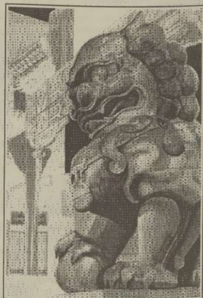
Chinese Gates by Andrew Larkin

Look to your future . . . Strengthen your education . . .