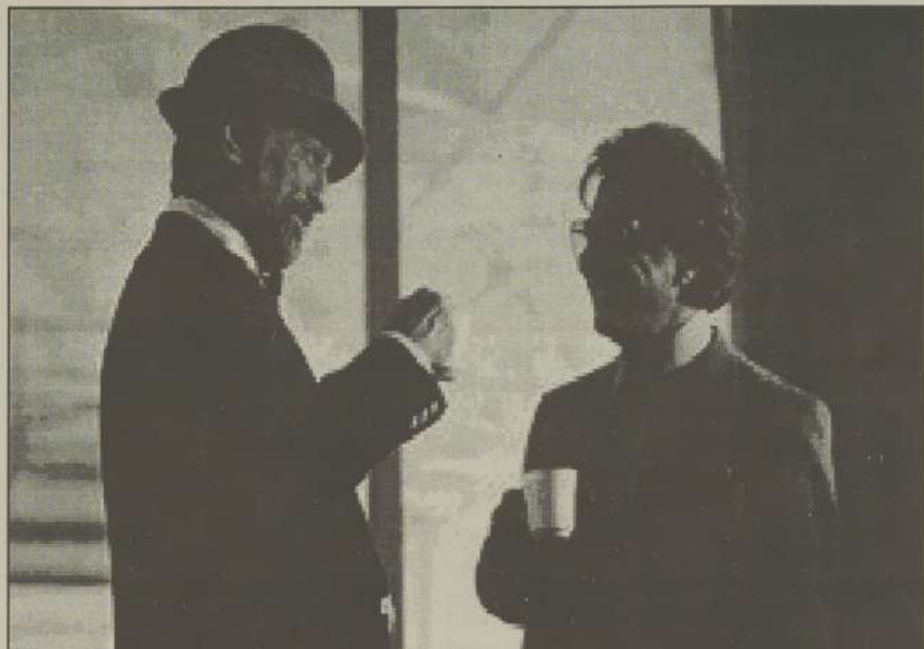
Robert DeNiro gives Dustin Hoffman some sound advice on mingling politics with filmmaking.

The small price tag and high entertainment value of "Wag the Dog" show that you don't have to spend $200 million to make a quality film in the late 1990's.