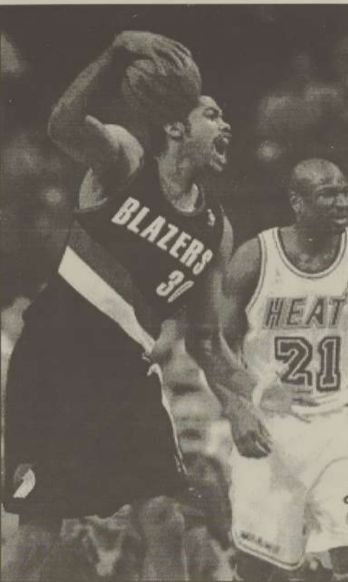
Trailblazer Rasheed Wallace's aggressive play leads Portland against the best in the world this 1997-98 season

The Blazers hosted Minnesota yesterday but the game had not been played at press time. The team plays at Houston on Friday and at Dallas on Saturday.