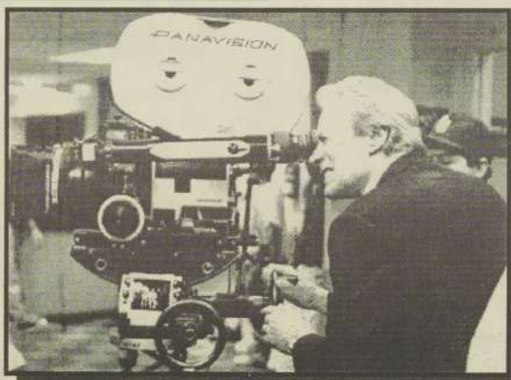
Here Clint Eastwood is seen checking the camera angles for a scene being filmed on a set resembling a Washington D.C. hospital.

"The Empire Strikes Back" returns to theaters this Friday, Feb. 21. Call theaters for show times.