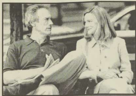
Luther Whitney (Clint Eastwood) and Kate Whitney (Laura Linney) take a break from their busy lives to sit and chat.

"This is a suspenseful, character-driven story, and the actors who appear in "Absolute Power" are the best that I could find. I'm very pleased with the result. I hope audiences will be too."