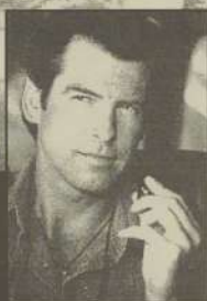
LINDA HAMILTON, ABOVE, AND PIERCE BROSNAN, RIGHT, BATTLE A VOLCANO IN THIS MONTH'S NEWEST NATURE-GONE- WILD MOVIE.