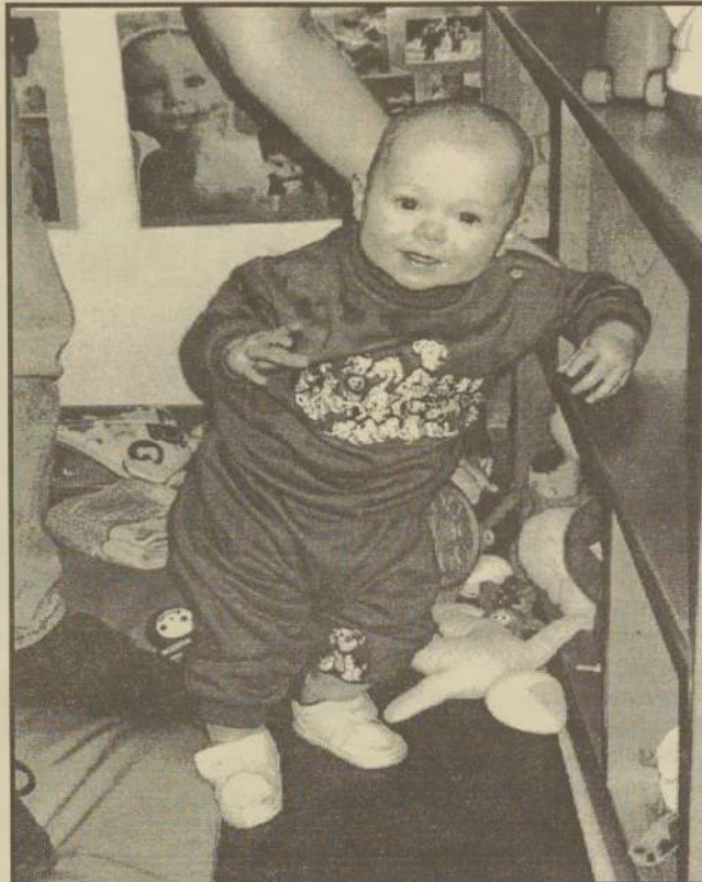
Some of the happy faces from the Camp Fire's Child Care Center at the Family Resource Center at Clackamas.

Each purchaser will receive a coupon good for $3 off any large Round Table Pizza. If used, Round Table will donate an additional $1 to Camp Fire programs.