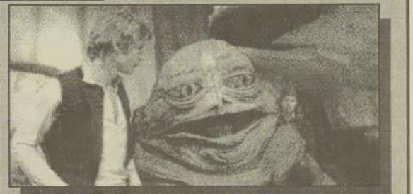
Above: The New CGI Jabba the Hutt scene from Star Wars, Below: The original pre-CGI scene filmed in 1975 (notice the grainy appearance of the original scenes, this will be cleaned up in the remastered scenes).