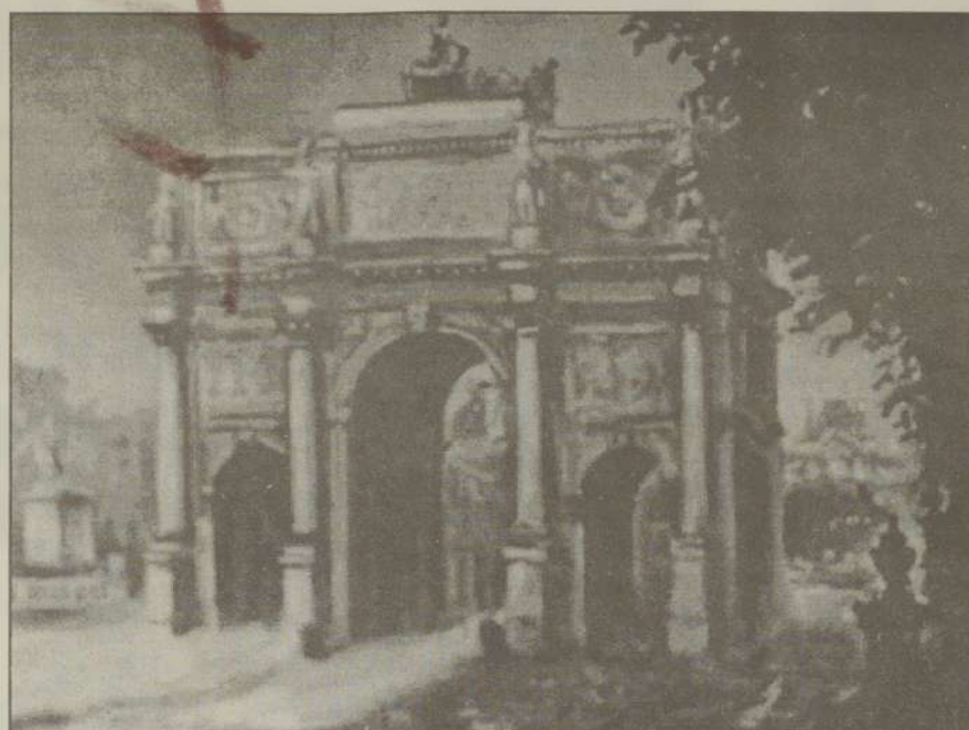
(Left) Civil War Buff, 1982 (Right) Paris, Arc Du Carousel, 1981