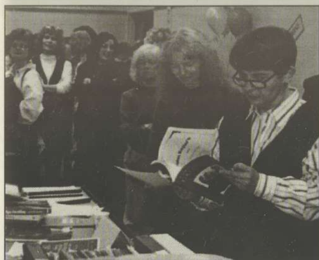
(Left) Staff members look over materials created by CCC faculty.