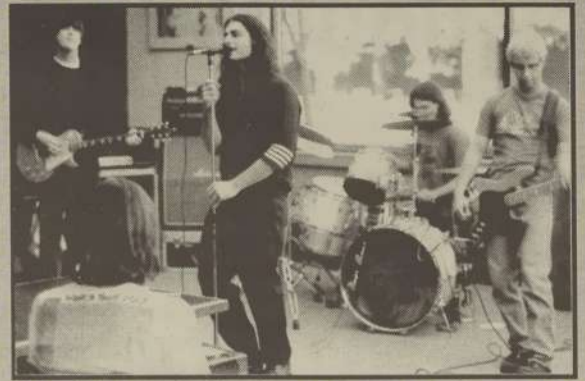
Would concert attendance on campus increase if performances were held outdoors?

Stubblefield was also the first winner of the writing contest.