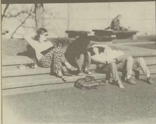
The month started off sunny with the hopes that spring would soon be here.

✓ Portland sees its worst snow storm in 25 years and Clackamas students and staff are given two days to defrost before beginning Winter term's final sweat