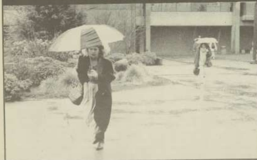
Then the inevitable...rain, rain and more rain.