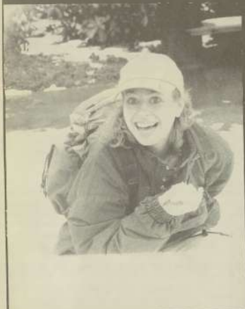
Then came the snow...