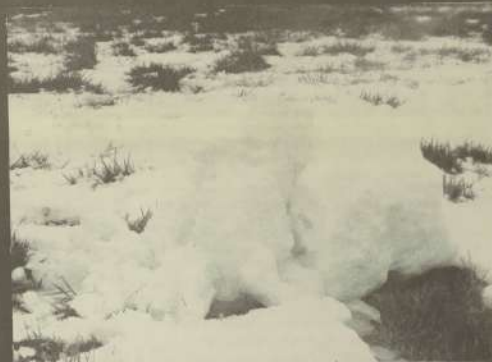
and we wondered if it would ever end.