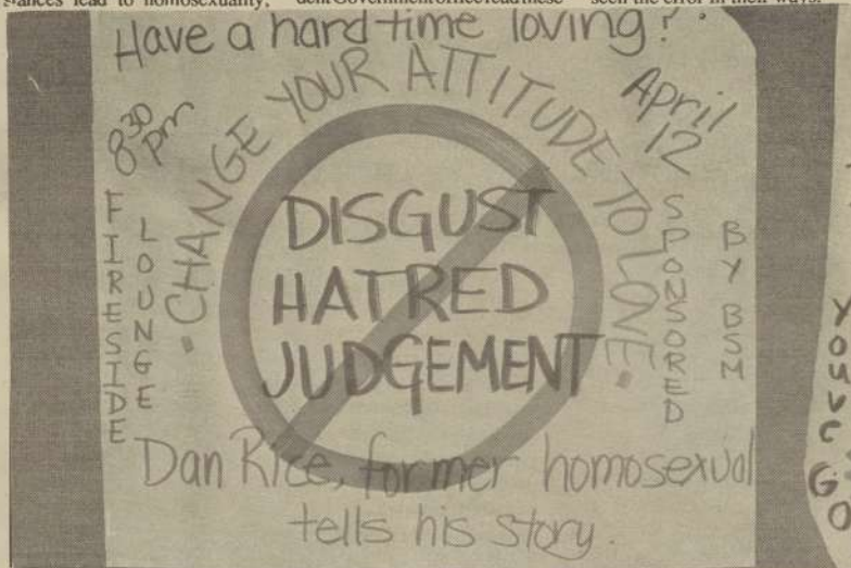
Just one of the posters on display by BSM advertising who knows what.