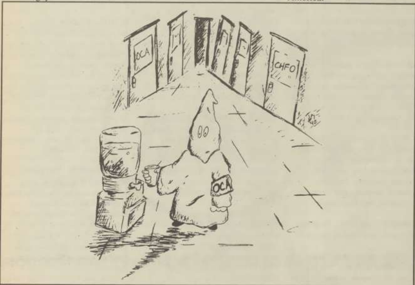
The burning cross is symbolic of a religion by organizations that use authoritarian ideology through the burning cross is a tactic used by racists to frighten minorities into submission.

The racist agenda was tested in Louisiana with the campaign of David Duke, where Far Right and Christian Right politics were merged. Duke was defeated by the extraordinary effort of the African-America community, which turned out 80% of its registered voters; otherwise, the 55% white vote would have elected Duke. In this case, the messenger (Duke) was defeated but the message won by