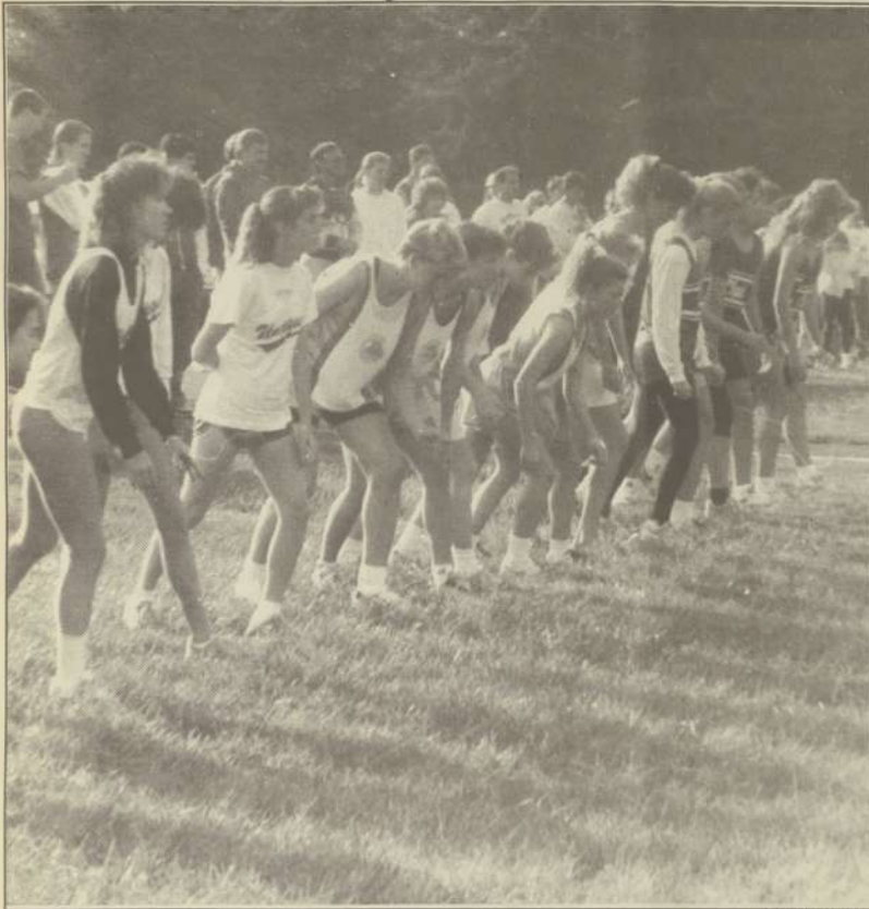
The women's side of the cross country team waits for the start of the run. All six runners on the team finished in the top ten.