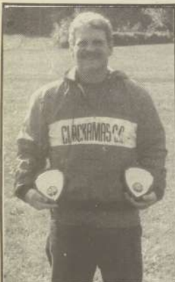
Qualifications: bachelor's degree and master's from U of O Years coaching: 26

What are your short and long term plans?: "I wouldn't be surprised if I was at Clackamas until I retire. I would eventually like to get into administration."