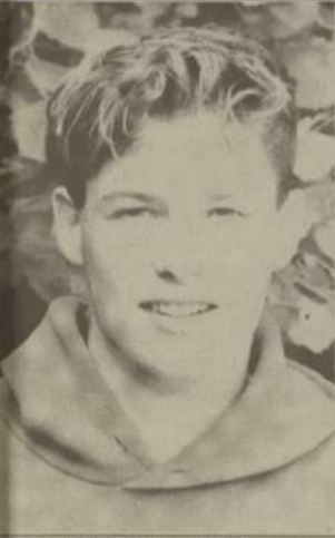
Date of Birth: 12-23-72 Sport: Cross Country High School: Rex Putnam Major: Engineering. "Right now, I don't have a speciality in

In order to make the playoffs, they must finish the last seven games of the season with no less than a 5-2 record for the second half.