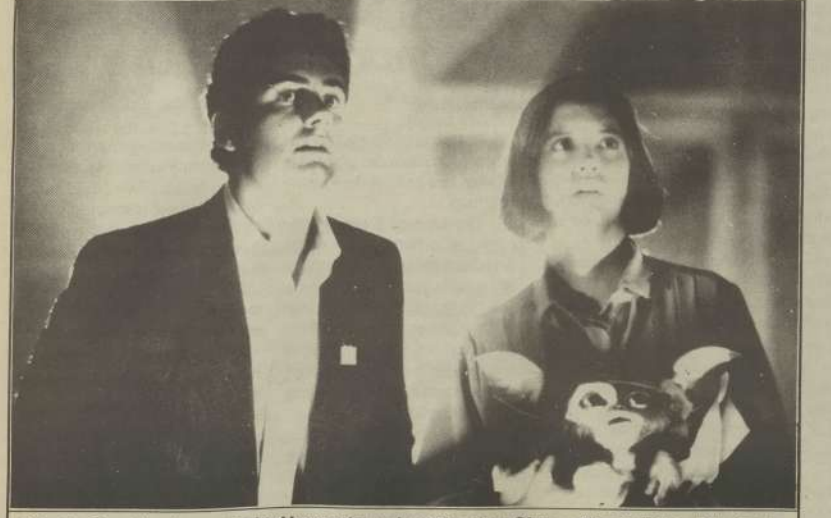
After the Gremlins have wreaked havoc throughout the glant Clamp office building, Billy (Zach Kate(Phoebe Cates) and Gizmo watch as the creatures approach in Gremlins 2.

DICK TRACY (JUNE 15): Walt Disney Pictures. Another comic book character comes to the screen. This crime-fighting, yellow fedora-wearing P.I. is now apparently 53 and going strong. With the success of last summers Batman, Tracy-mastermind Warren Beatty is hoping for big box office results. Although comic book heroes are a hot commodity, as is nostalgia, Dick Tracy has been on the drawing board for 13 years. The sets actually look like their 3-D version of comic book props. Cars and building are lierally generic to give it that comic-book authentic feel. Beatty has become infamous for his perfectionistic qualities, and now, for his offscreen affair with on-screen co-star Madonna. She plays a character unlike any shes portrayed before (thank goodness). Madonna