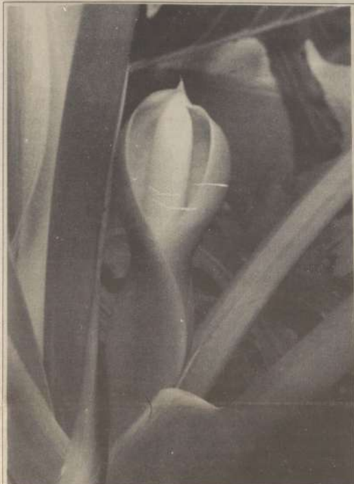
A Philodendron Selloum in bloom. Located in front of the biology labs in Pauling as part of the native gardens, this particular species blooms only once a year, some years not at all.