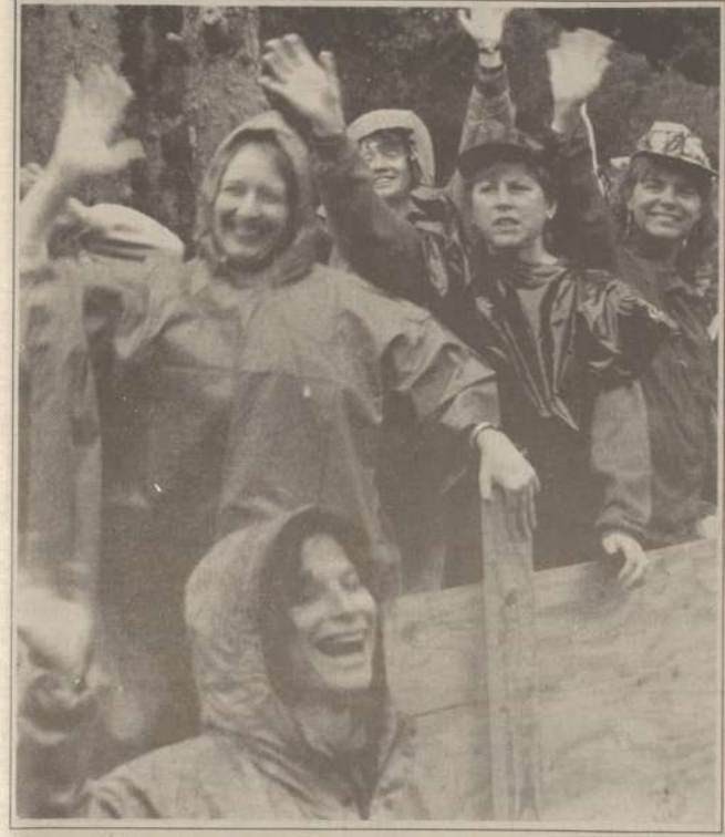
Women's Weekend participants say farewell at the close of the 1989 event. This year's Focus on Women Weekend will be held May 4-6 at YMCA Camp Collins.