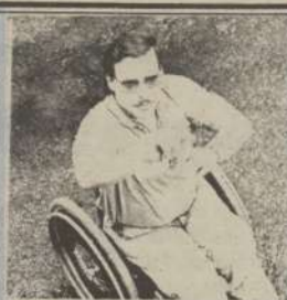
Gates makes the best of his abilities . . . see page 7