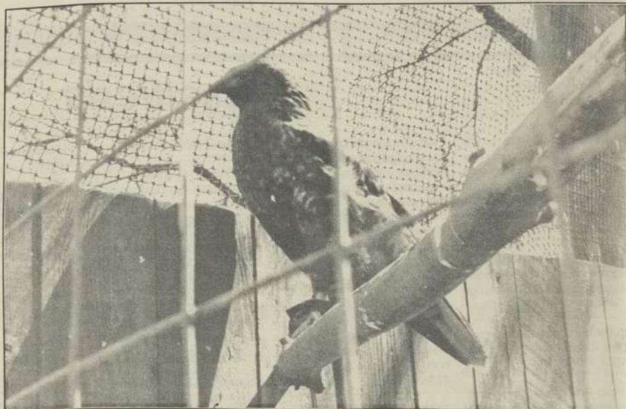
Birds and bridges arent the only interesting things at the Environmental Learning Center. Come and see for yourself.