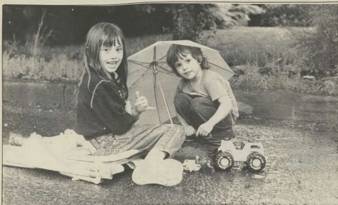
Rain wont stop these children from playing outside.