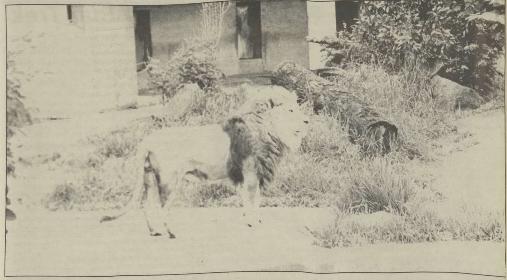
Who could be afraid of me?