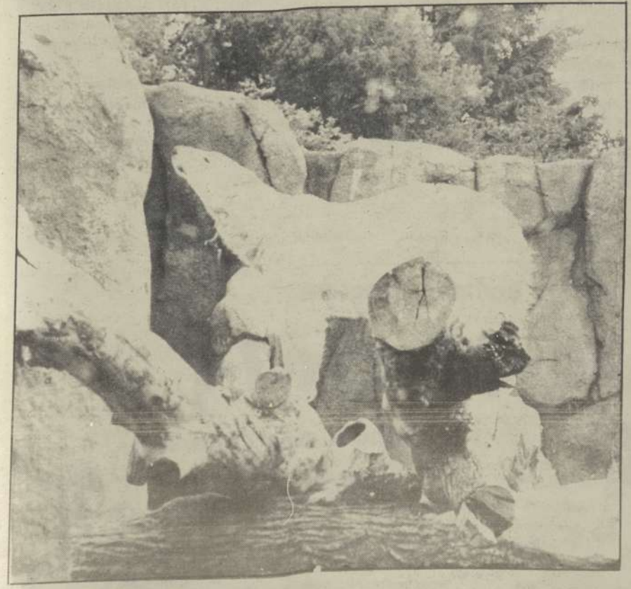
The smell of spring is in the air.